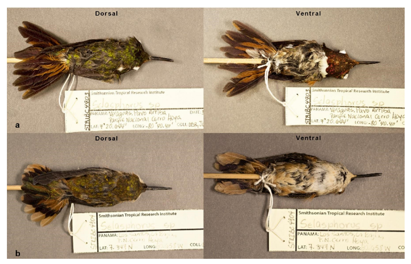
Figure 3 . Male (a) and female (b) specimens of Selasphorus cf. ardens from Cerro Hoya National Park, Panama. Dorsal (left) and ventral (right) view of the collected specimens deposited at STRIBC. Due to the light incidence angles, the gorget of the male shows darker color and lack of iridescence than under frontal conditions.

Two of the male specimens present an iridescent deep orange-red gorget color, likely matching the gorget plumage of Selasphorus ardens as judged by images by Dyer & Vallely (2017); yet we were unable to compare specimens side by side. However, this color is noticeably different in S. scintilla, S. flammula, and C. bryantae. We next compared color patterns and rectrix shape of tail feathers with the CHNP specimens, referencing the descriptions by Stiles (1983). We found that the tail color pattern of our specimens resembles those of S. ardens. The males show a low degree of emargination on rectrix 1 (r1), which is typical of both S. ardens and S. scintilla. CHNP male specimens have darker rectrices than S. scintilla matching the phenotype of previously collected S. ardens (Stiles 1983). The tail of the female also matches Stiles' description showing a low degree of emargination in all rectrices (Figure 3b) and a wide green stripe in r1. However, the lack of verifiable specimens (Dale & Vallely 2017) for this species impedes discrimination based on this trait.